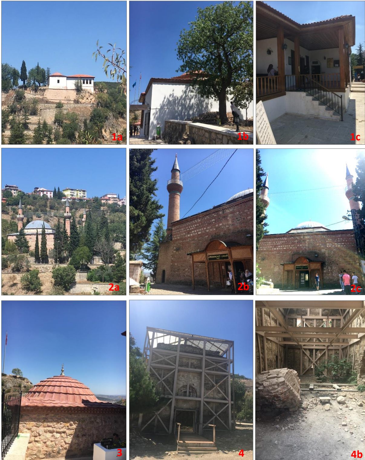
Figure 2. Historical items of Bilecik city (1a,1b,1c: Seyh Edebali Tomb; 2a,2b,2c: Orhan Gazi Mosque; 3: Bala Hatun tomb; 4a, 4b Orhan Gazi's İmaret) (Kahveci, 2018)