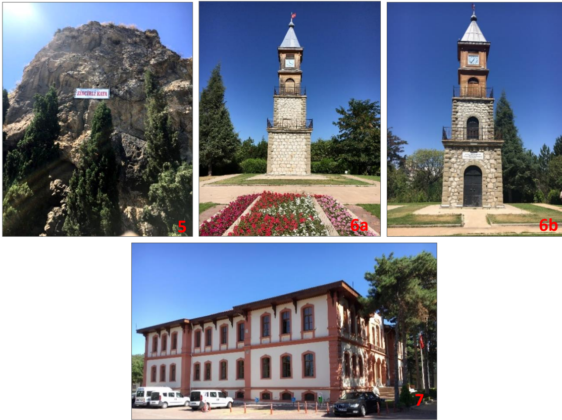
Figure 3. Historical items of Bilecik city (5: Chained rock; 6a, 6b: Clock tower, 7: Municipality building)