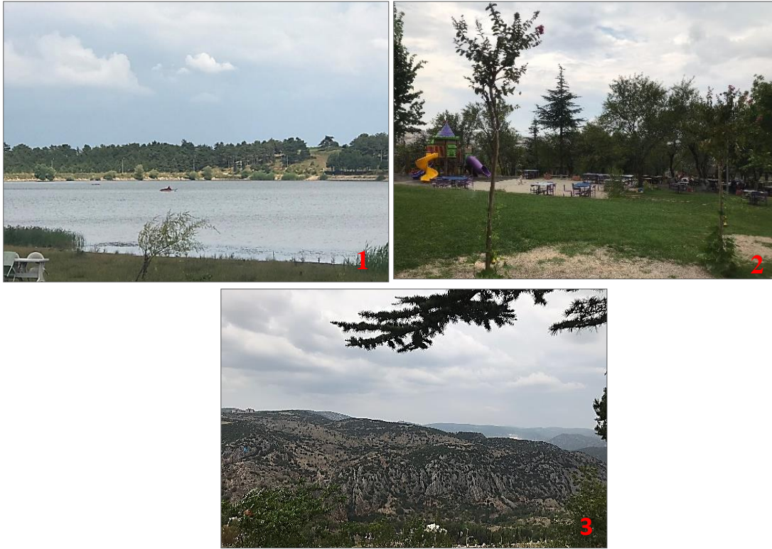
Figure 5. Natural items of Bilecik (1: Pelitözü pond; 2: Bilecik urban forest; 3: Topographical features of the city and its surroundings)