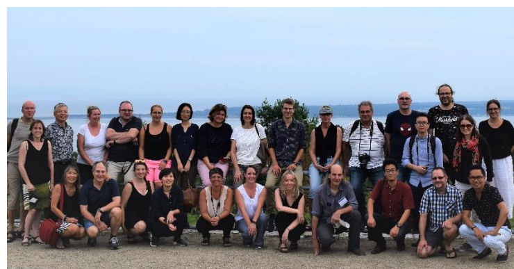
Conference participants at the pre-conference meeting in La Malbaie, Quebec

Some 30 tourism geographers from all continents met at the Fairmont Le Manoir Richelieu in La Malbaie; Charlevoix, on the northern shore of the St Lawrence River, Canada. The location in itself carries significant tourism heritage being a summer resort for not least residents from Quebec for more than 100 years. Recently however, the Fairmont Hotel has been the venue for the G7 Summit in June 2018 and indeed the Commission had its meeting in the same room that recently had seen the clash of the heads of states over free trade terms and volumes. Indeed, our meeting has been far more successful and productive.