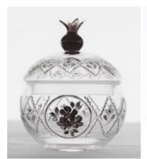
Beykoz Glass Decoration Art

Handicraft: Handicrafts are also an important intangible cultural heritage value for Istanbul (Photo 1) Although the product obtained as a result of the work done is tangible, these elements are also evaluated as intangible cultural heritage elements due to the construction process. The fact that the third biggest bell-maker of the world is the Istanbul Agop Cymbals and the handmade Istanbul Cymbals are an important potential for the city. At the same time, with the silvering tradition in Eminönü-Inns district, it is still a matter of importance for the city that the relationship of mastery-apprentice still continues.