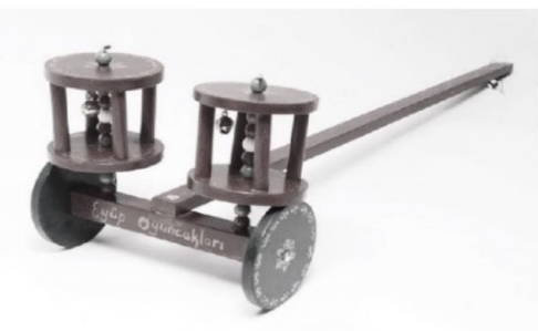
Traditional Toy of Eyup