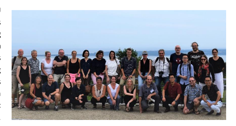
Conference participants at the pre-conference meeting in La Malbaie, Quebec

Some 30 tourism geographers from all continents met at the Fairmont Le Manoir Richelieu in La Malbaie; Charlevoix, on the northern shore of the St Lawrence River, Canada. The location in itself carries significant tourism heritage being a summer resort for not least residents from Quebec for more than 100 years. Recently however, the Fairmont Hotel has been the venue for the G7 Summit in June 2018 and indeed the Commission had its meeting in the same room that recently had seen the clash of the heads of states over free trade terms and volumes. Indeed, our meeting has been far more successful and productive.