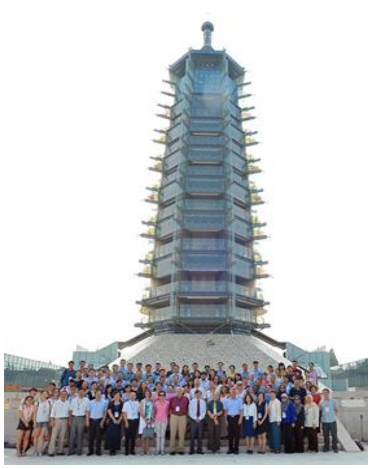
Group photo on the opening ceremony at the Porcelain Tower Monument Park in Nanjing

The theme of the symposium was "Geography and Planning: Creating a New Tourism Landscape" with 9 subtopics: The tourism landscape as a storytelling, Challenges and best practices of tourism planning, Sustainable tourism policy and planning, Governance in urban tourism destinations,